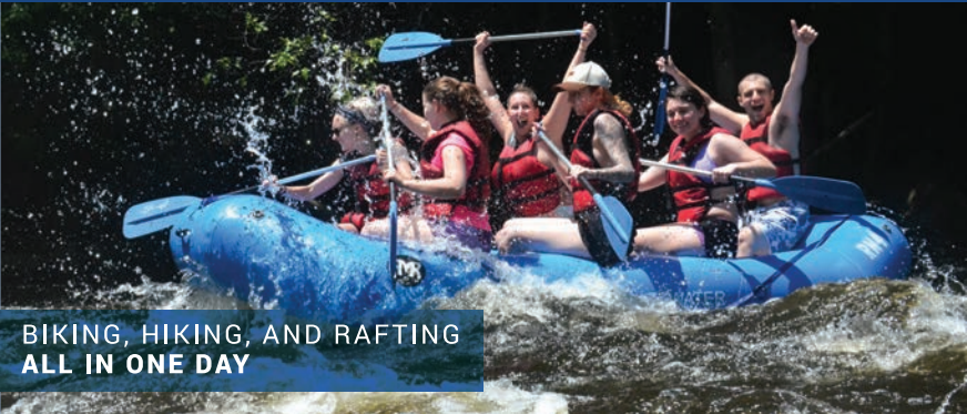
BIKING, HIKING, AND RAFTING ALL IN ONE DAY